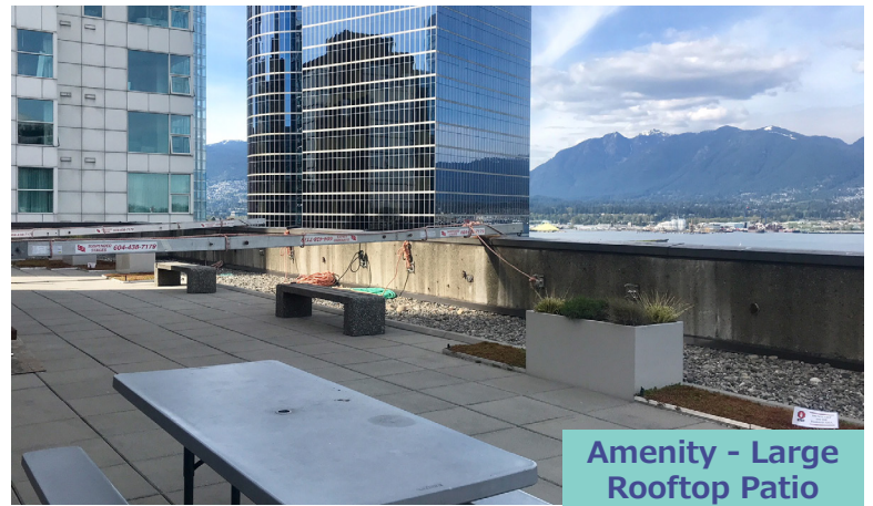
Amenity - Large Rooftop Patio