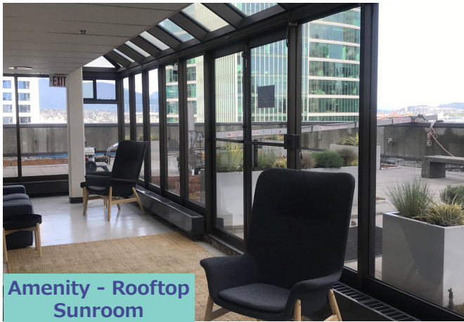
Amenity - Rooftop Sunroom