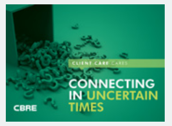
Client Care - CBRE Connecting in Uncertain Times