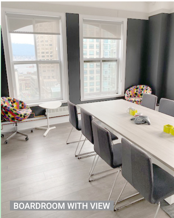
BOARDROOM WITH VIEW