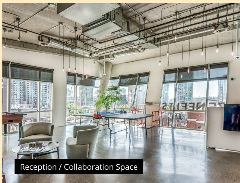
Reception / Collaboration Space