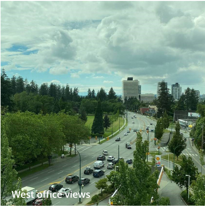
West office views