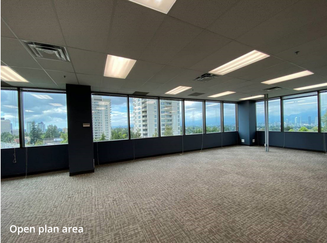
Open plan area