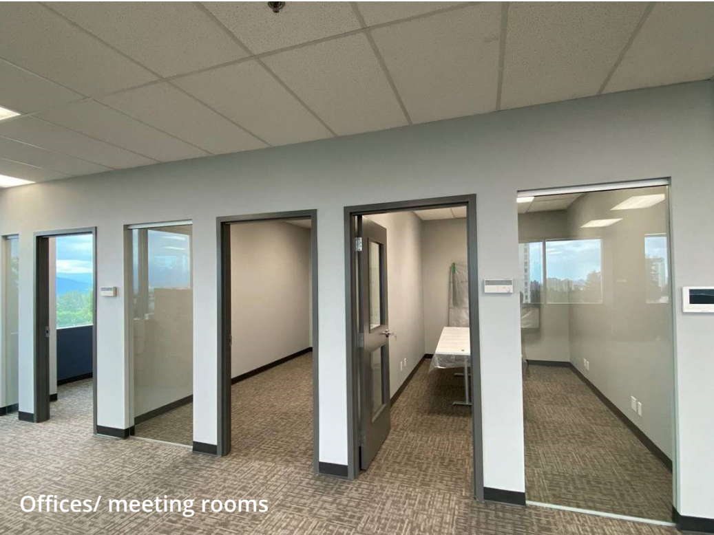
Offices/ meeting rooms