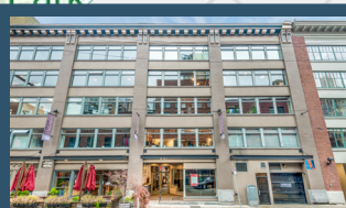
1168 Hamilton Street